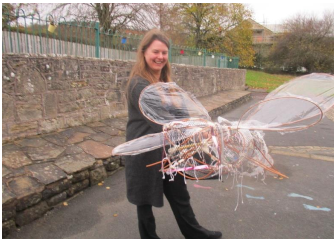
One of Class 2's fantastic sculpture bugs

Class 2's second workshop with Brod (creative sculptor) followed on from the fantastic willow frames 'skeletons' to create their 'outer skin'. Please look on your child's Class Dojo to see a photo of their sculpture! Class 1's sculpture day was held in tandem and the children created 3D fireworks and set them off...safely...with tissue paper flames and wonderful dancing. Thank you for sending in recycled materials so that we could continue our exciting projects.